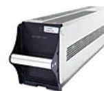
Symmetra PX Battery Unit