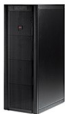
APC Smart-UPS VT Extended Run Frame, W/Breaker, 2 Batt. Modules Exp. To 6, And 5x8 Startup Service

View all accessories and replacement batteries for this product