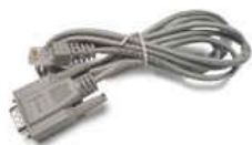
Cisco Unity Express UPS Simple Signaling Cable

View all accessories and replacement batteries for this product