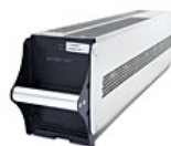
Symmetra PX Battery Unit