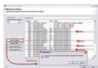
StruxureWare Data Center Expert Modbus TCP Output Module

View all accessories and replacement batteries for this product