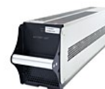
Symmetra PX Battery Unit