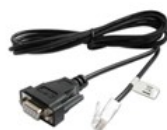
UPS Communications Cable Smart Signalling 6/2m - DB9 To RJ45