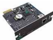
UPS Network Management Card 2