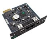
UPS Network Management Card 2 With Environmental Monitoring

View all accessories and replacement batteries for this product