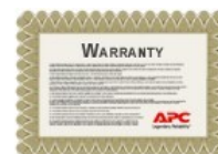
1 Year Renewal Extended Warranty For (1) Smart-UPS 2.1-3kVA