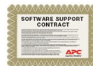
3 Year Renewal Extended Warranty For (1) Smart-UPS 2.1-3kVA