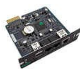
UPS Network Management Card 2 With Environmental Monitoring