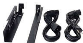
APC KVM 2G, LCD Rear Mounting Kit

View all accessories and replacement batteries for this product