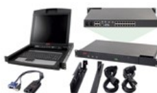
APC 2X1X16 IP KVM With APC 17" Rack LCD And USB VM Server Module Bundle